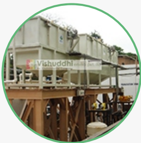
Dissolved Air Floatation System

Economical means of removal of oil & solids from waste water by gravity in a smooth, efficient automatic flow.