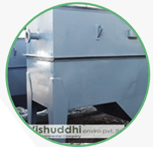
Corrugated plate interceptor

High torque central/peripheral driven clarifiers, clariflocculators, High rated solid contact clarifiers & thickeners.