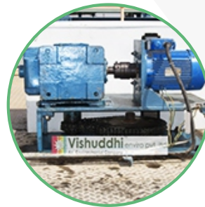
Clarifiers & clariflocculator

Reliable Agitator & Stirrers for Flash mixing, Slow mixing, Coagulation, Flocculation etc.