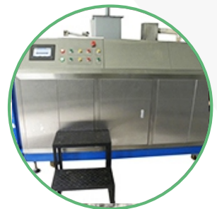
Organic Waste Composter

An oil skimmer is a machine that separates a liquid from..