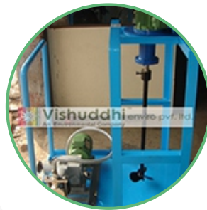
Agitator & reaction stirrer

Energy efficient Aerators to reduce the BOD load.